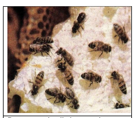
Bees are a deadly horror when they all swarm!

When beekeeper Reed Booth invited the team to film wild "killer beehive" extraction, the sound and cameraman had to wear fully sealed bee suits in 34 °C weather.