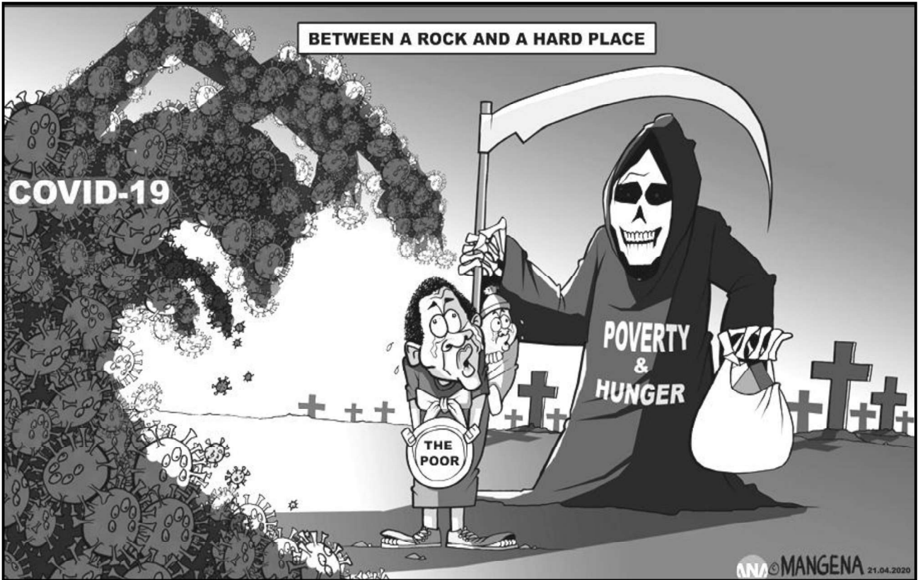
[From https://jcom.sissa.it/sites/default/files/documents/JCOM_1907_2020_A08.pdf . Accessed on 30 May 2021.]

The cartoon below, by H Mangena, appeared in an online publication of the African News Agency on 21 April 2020. The cartoon highlights the challenges faced by the poor as a result of the Covid-19 pandemic.